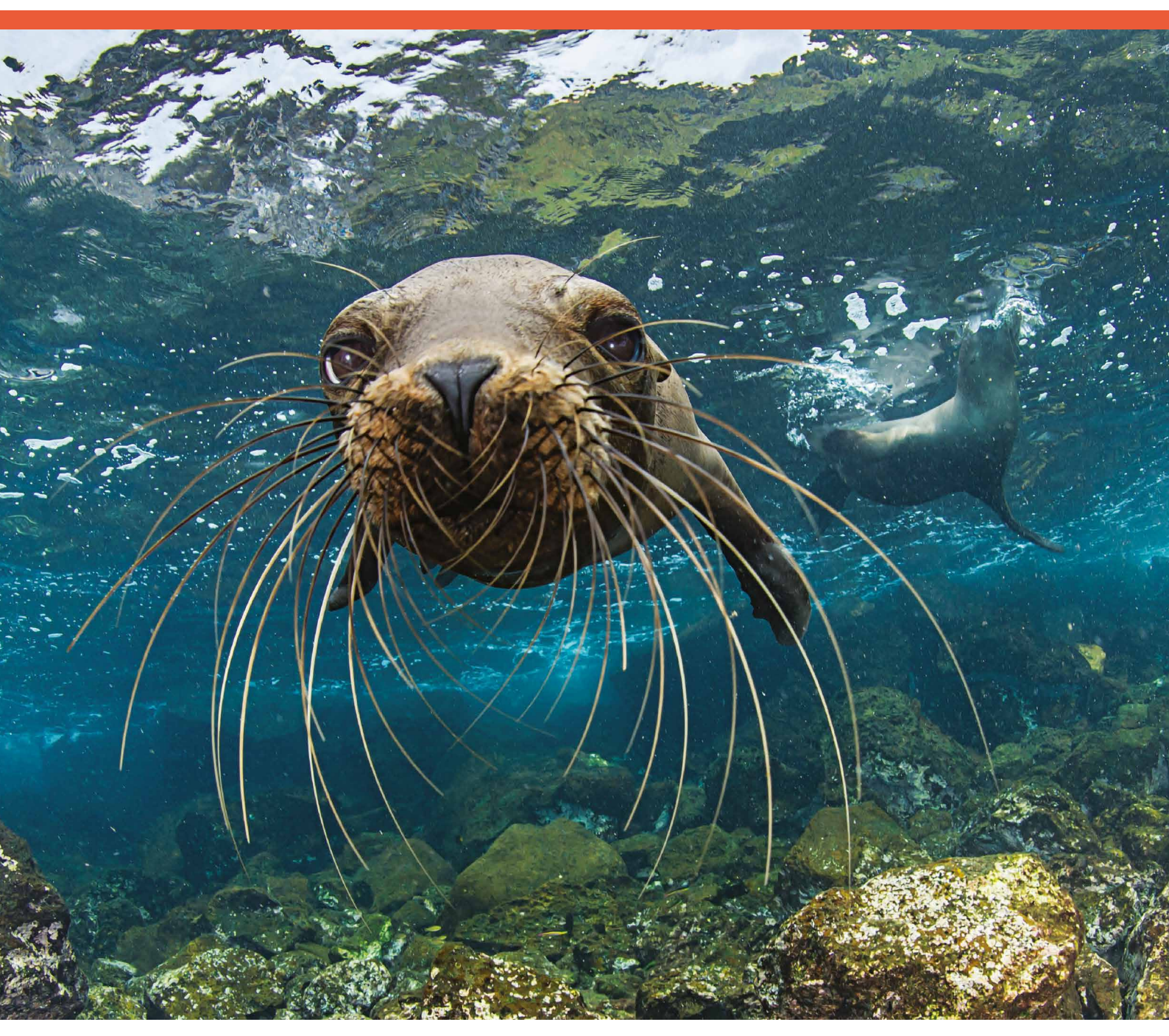
Galapagos Islands.

The marine manager portal will include an open, public dashboard and private, collaborative workspaces. The workspaces provide invited users with interactive tools to generate spatial and time-series analysis and visualization of fused datasets, upload static layers and time-series data, and download all data for advanced research techniques.