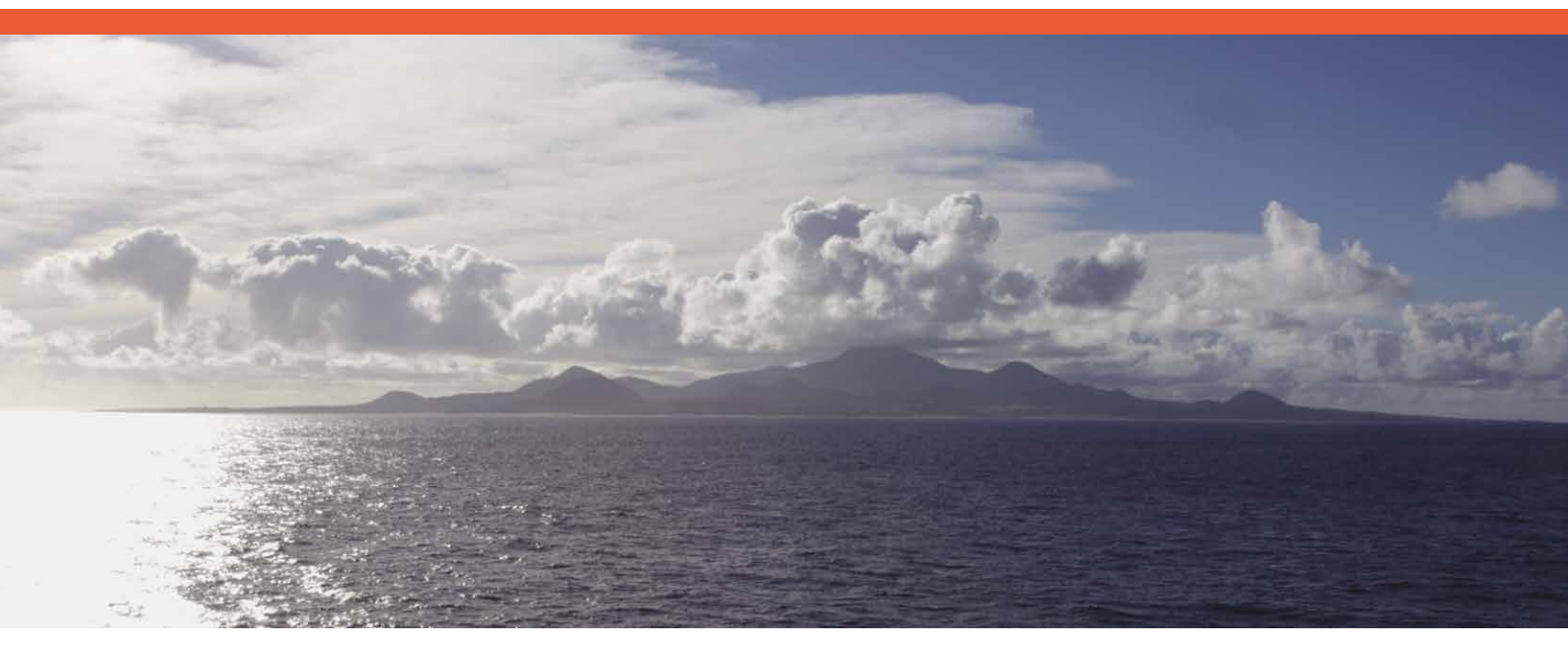
Ascension Island.

"Global Fishing Watch's marine manager portal enables us to harness the power of big data to monitor, understand and manage the entire 170,000 square miles of Ascension Island's marine protected area. Data has the potential to revolutionize our ability to protect marine environments, and with Global Fishing Watch's support, we now have the capability to capture and analyze such large amounts of information. Global Fishing Watch involved us from the beginning to ensure the portal's design meets our particular management needs. The outputs are so intuitive and beautiful that they serve not only as a vital management resource but also as a compelling engagement tool that connects the Ascension community and global public with one of the most remote areas of the ocean."